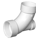
Part No. PVC 307 Long Sweep 1/4 Bend with Low Heel Inlet (ALL HUB)